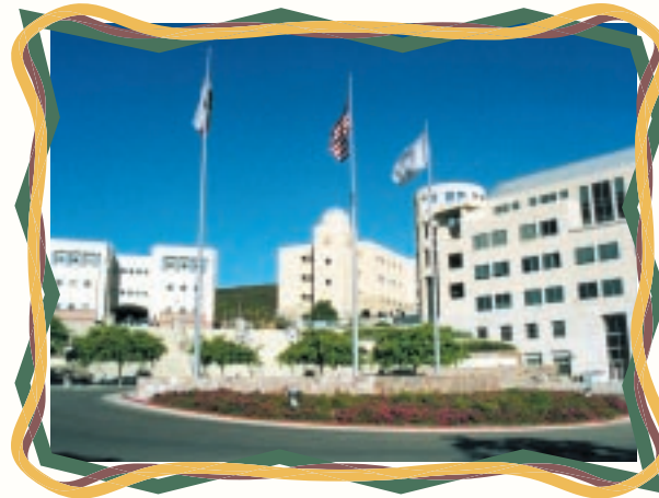
Cal State San Marcos, San Marcos, California Location of the National Latino Research Center