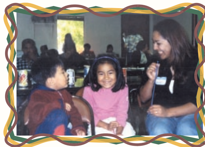
A school readiness focus group facilitated by the NLRC for the Vista Unified School District. Vista, CA, September 2002

Research findings are prepared in a variety of formats to meet the unique needs of a diverse clientele. This includes scholarly reports, fact sheets, executive summaries, white papers, printed and electronic publications, presentations, press releases, press kits, and press conference reports.