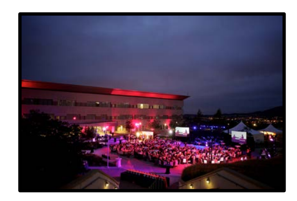
To purchase your tickets go to: http://www.csusm.edu/gala

Join us for this special 25<sup>th</sup> Anniversary celebration for the Silver and Blue Gala that will be held on Saturday, June 20 beginning at 6:00 pm on the Kellogg Plaza under the stars. Guests are encouraged to wear silver and/or blue.