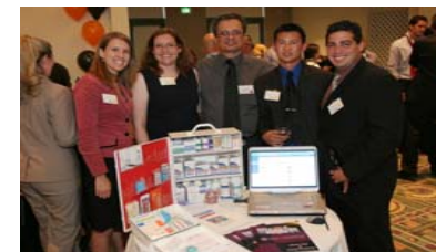
A CSUSM College of Business (CoBA) Senior Experience student team. Over 4,000 students have participated in over 1,000 Senior Experience projects in the past 15 years.