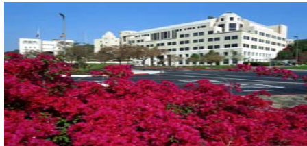
Craven Hall, CSUSM.

California State University San Marcos (CSUSM) is a comprehensive regional undergraduate university with approximately 8000 students, located in north San Diego County. At less than 20 years old, CSUSM is at a very early stage of development; thus there is a significant opportunity to have an impact on the campus culture as the institution matures. The Committee for Undergraduate Research (CUGR) was established to move CSUSM toward institutionalizing undergraduate research campus-wide. Our long-term goal is to become a campus where undergraduate research is a priority and where faculty and students involved in research are supported and recognized by the university. Early successes include official recognition and support from the Provost and recruitment of an interdisciplinary team of faculty to join CUGR. We will report details on our action plan, anticipated challenges we will likely face, and opportunities for success.