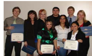
Student finalists, 2008 CSUSM Student Research Competition.