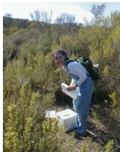
Biology student conducting independent field research on the CSUSM campus.