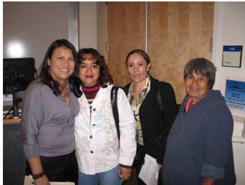
Members of LLEA with NLRC Director

For more information about this grassroots organization, please contact the NLRC at nlrc@csusm.edu .