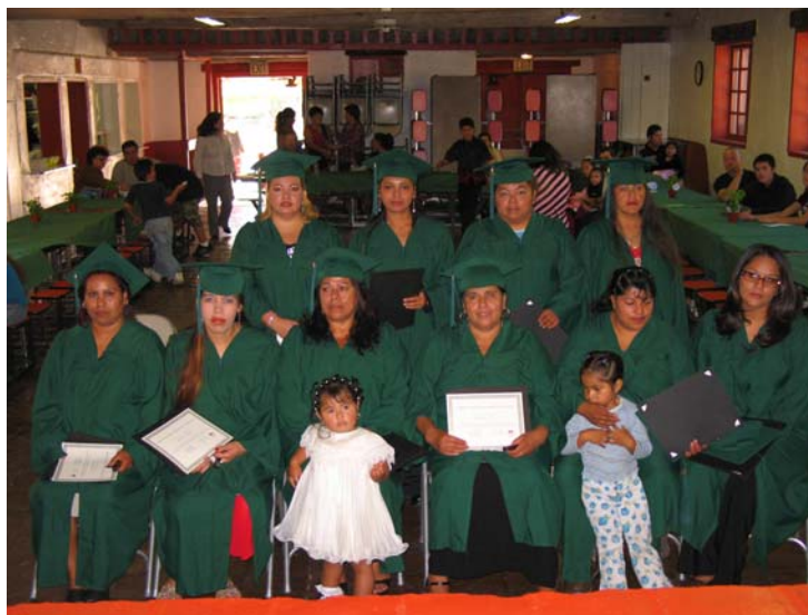
Promotoras in Pala, California Graduation Day - October 22, 2006