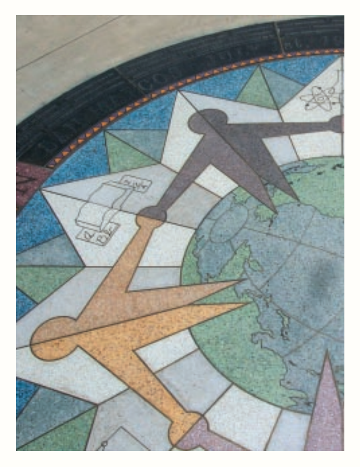
"Diversity Seal" at Cal State San Marcos