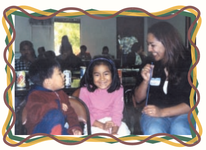
A school readiness focus group facilitated by the NLRC for the Vista Unified School District. Vista, CA, September 2002

Research findings are prepared in a variety of formats to meet the unique needs of a diverse clientele. This includes scholarly reports, fact sheets, executive summaries, white papers, printed and eletronic publications, presentations, press releases, press kits, and press conference reports.