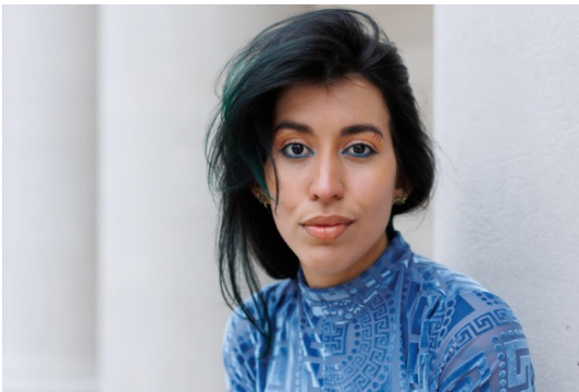
Our Work, Our Dignity Feb. 8, 6:30 p.m., Arts 111

Diverse and entertaining A&L series for spring