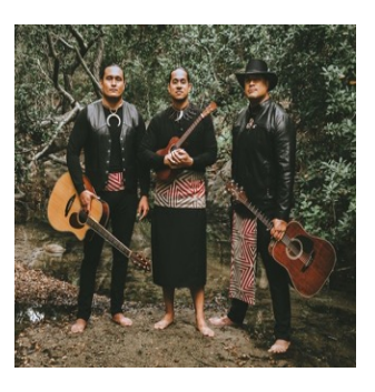
Faiva O Samoa: An Evening with FAIVA Monday, Oct 16 6-8 p.m.

An exciting evening of traditional Samoan music played with acoustic guitars, selo and 'ukulele, along with traditional Samoan percussion instruments that draw influence from the melodic storytelling traditions from throughout Polynesia.