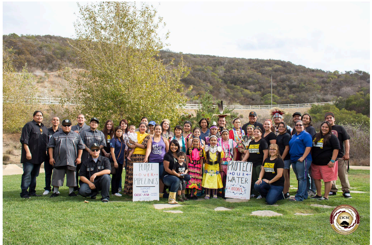
AISA at the 2016 Heritage Day/ Standing Rock Rally

The American Indian Student Alliance meets every Tuesday at U-hour (noon) at the CICSC in SBSB 1118. This semester, AISA plans on coordinating more events with our native communities. We will be outreaching to youth programs by offering to facilitate field trips and events to get students interested in postsecondary education. We will also be planning fun events for the campus community, including movie screenings, game nights, and fundraisers. Please join us for a fun filled semester!