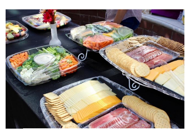
Cheese plates, crudités, and more!

"I thoroughly enjoyed being a part of this meet and greet. I loved being able to meet new faculty and students on campus, I even got to see old classmates whom I had not seen for a while. As a transfer student, I find this event very valuable to my success on campus. Also, the meat and cheese plate was better than I could have expected!"