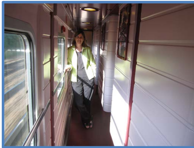
Traveling in the Elipsos Train

Giving up being an active member of my CSUSM community was the hardest part of retirement for me. However, after mourning that impending loss during my last year on campus, I have found that, for me, being retired does indeed mean life on another planet. And on this new planet, life is good and it is full, really good and really full. Daily, I am aware of how fortunate I am to have this privilege of retirement, this privilege of being able to find a balance between breathing and other activities such as more travel, being more politically active, being involved in my broader community motivated by my continued passion for social justice, seeing more of my friends and family here and around the world.