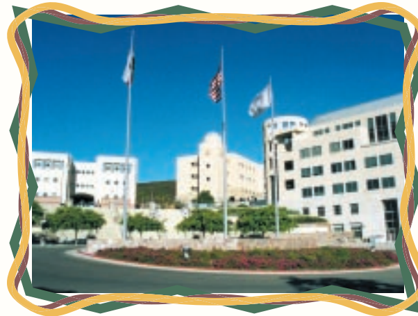
Cal State San Marcos, San Marcos, California Location of the National Latino Research Center