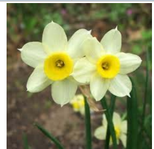
March Flower: The Daffodil

March is Brain Injury Awareness month! For more info, see http://www.biausa.org/brain-injury-awareness-month.htm .