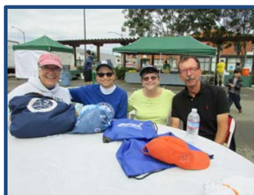
Ready to tailgate