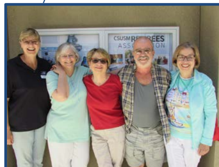
Your 2015/2016 Board of Directors ready to serve you!

So...What do you say..."Shall We Dance" this year? Sounds "lov-er-ly" to me!