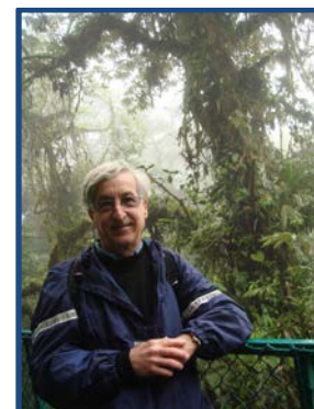
2011 in Costa Rica

I feel extremely lucky to have worked at CSUSM for its first 21 years at the campus site and witnessed its successful growth and to have worked with and met so many wonderful people.