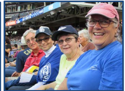
Happy retirees...join us!